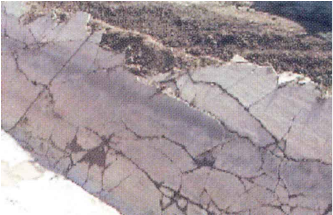
Photograph 1 – Condition of Concrete Liner Typical of Mission Main Canal