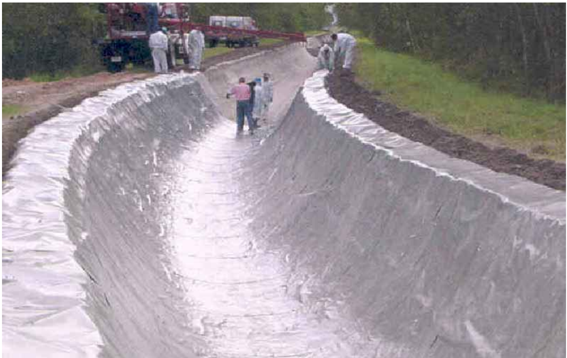
Photograph 2 – Urethane Liner Placed in Hidalgo Irrigation District No 1 Canal